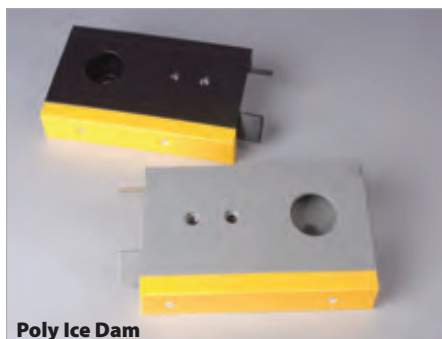
Poly Ice Dam