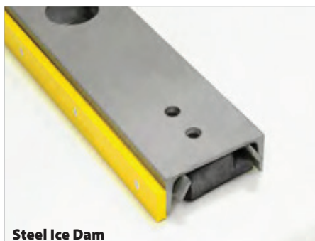
Steel Ice Dam